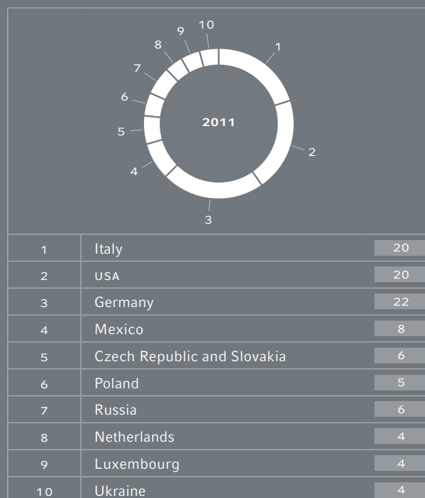
Sales Revenue by Region (in %)